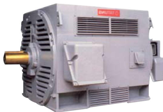
TH92D steel rolling motor