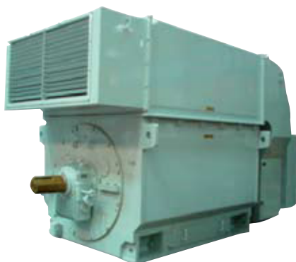
High Voltage Induction Motor