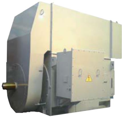
Horizontal Slip Ring Induction Motor